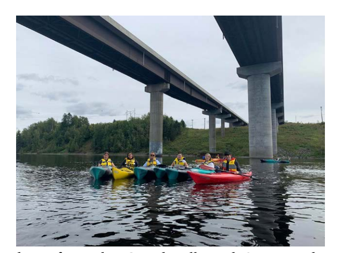
Students from the Grand Falls and St-Leonard areas gathered on the river to do some kayaking together.