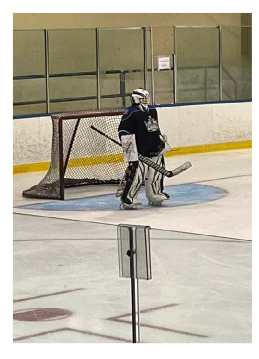
Enya used to play inline hockey in Switzerland. She decided to try ice hockey at Polyvalente Louis-Mailloux.